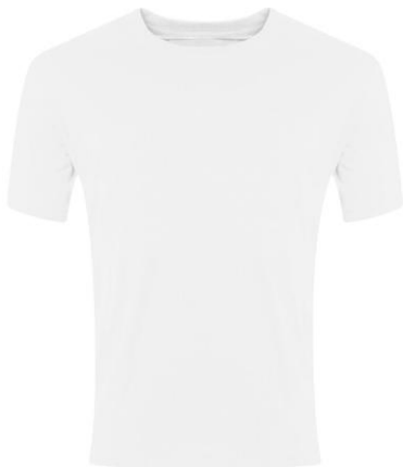
white t shirt

black trainers or plimsolls with black sole and no visible branding