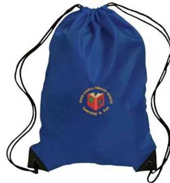
PE kit bag

Part of PE Kit Bundle 3 Items for £15.50