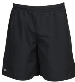
Black Microtech PE Shorts