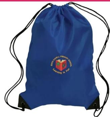
Edith Cavell Primary School PE Bag