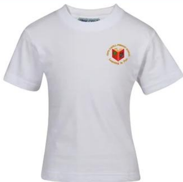
Edith Cavell Primary School PE T-Shirt

Part of PE Kit Bundle 3 Items for £15.50